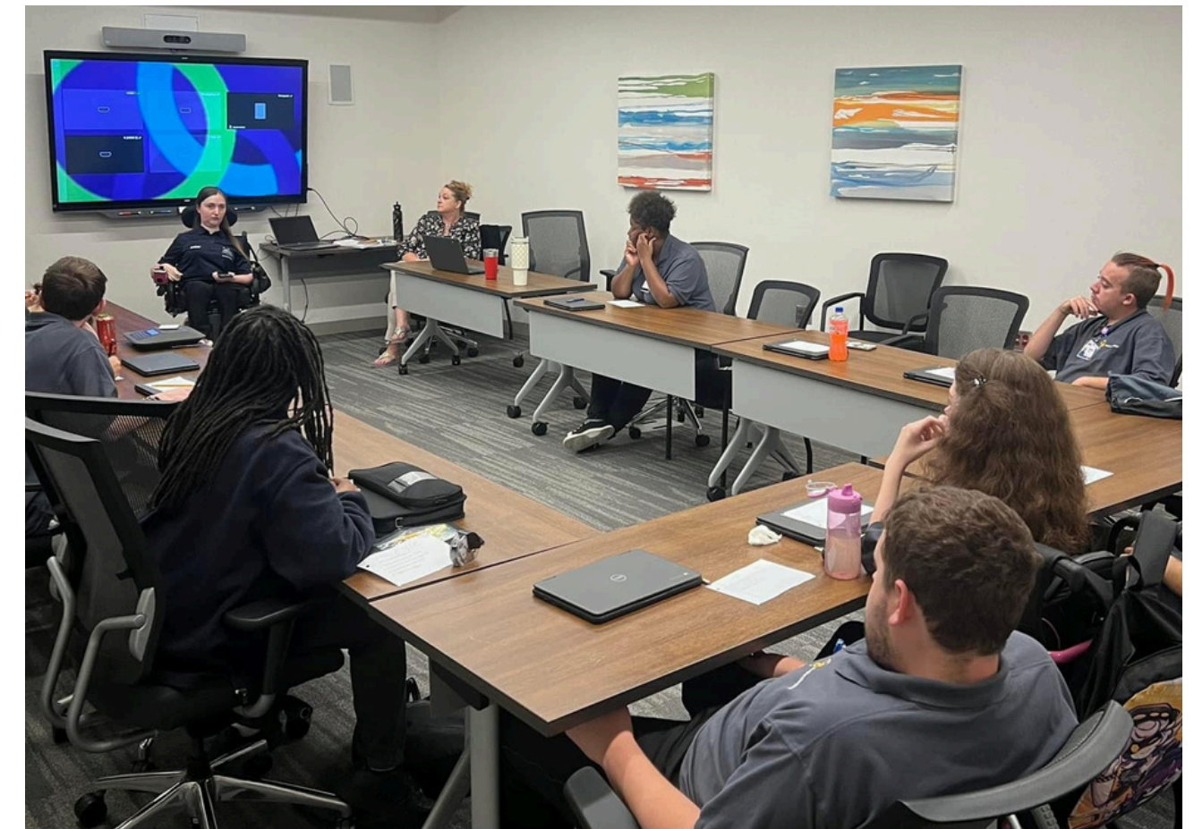
Project SEARCH interns listening to a presentation.