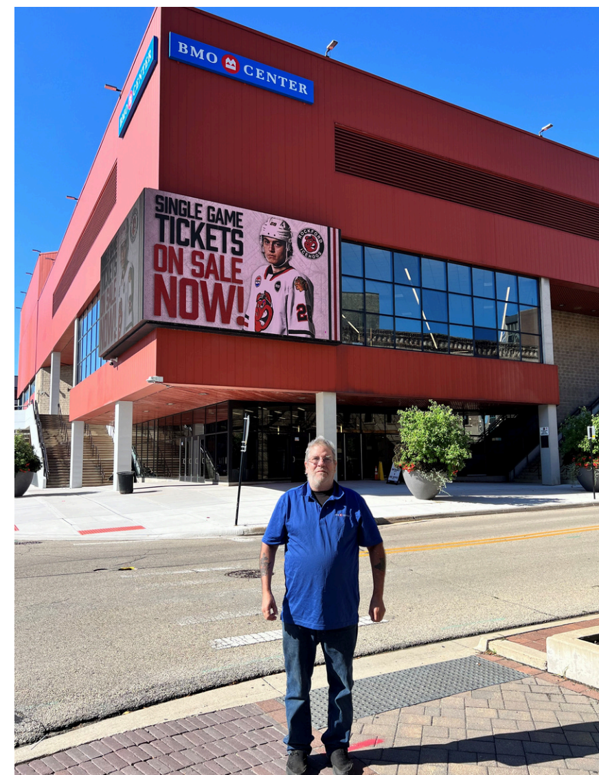
Employment consumer heading to work.

# of job consumers that have obtained jobs since the beginning of the employment program.