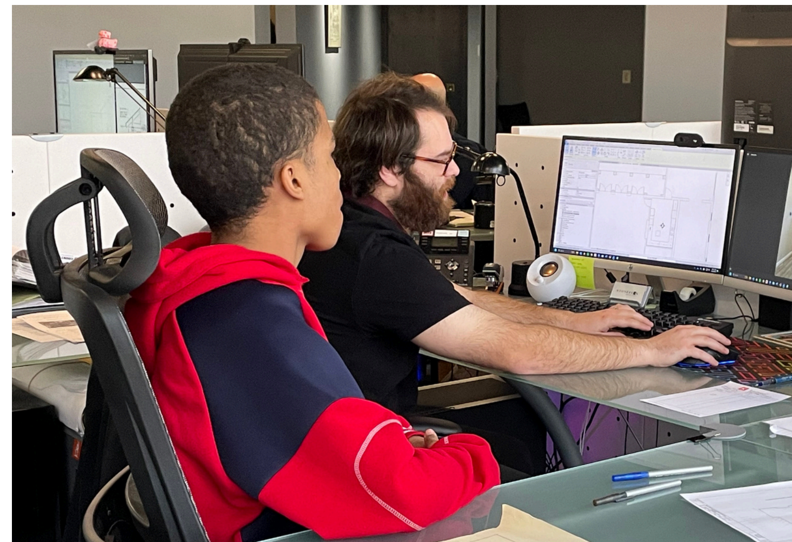
Fast Track student doing a job shadow in a professional office setting