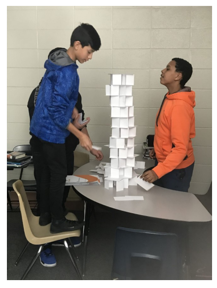
Middle school students participating in an Ignite curriculum activity.