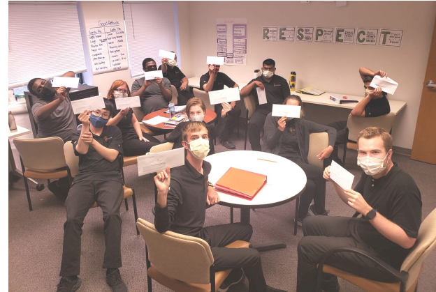
Project SEARCH Interns at Northwestern Medicine Kishwaukee Hospital receive their department internship assignments.

RAMP now has three Project SEARCH locations, two in Rockford, Mercyhealth at Rockton Ave. and Embassy Suites downtown as well as one in DeKalb at Northwestern Medicine Kishwaukee Hospital.